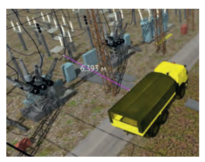
▲ Figure 6, Automatic tracking of the shortest distance between a moving vehicle and a high-voltage wire.

by moving machines and workers, the user can create the desired configuration. (Figure 6). 2D schemes can be created using orthoprojections (Figure 7).