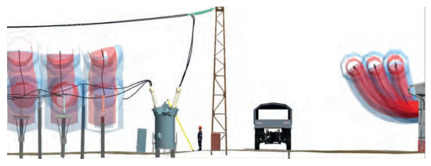
▲ Figure 7, Orthographic projection of a part of the 3D model for planning repairs.

The third use case relates to planning of maintenance and repairs. Distances between objects can be measured in the model and,