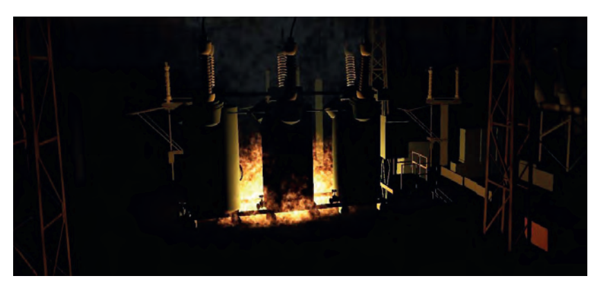
Figure 5, Animation of a fire emergency during the daytime (top) and at night.

iterative refinements based on customer wishes. The application was implemented on workstations at the power substation, the GUI is simple and intuitive, and field engineers do not need to learn to work with complex CAD systems and graphics editors. These are important advantages of gaming software. The model can be visualised in both mono and stereo; the latter significantly increases the immersion and features task-based training and game-based learning.