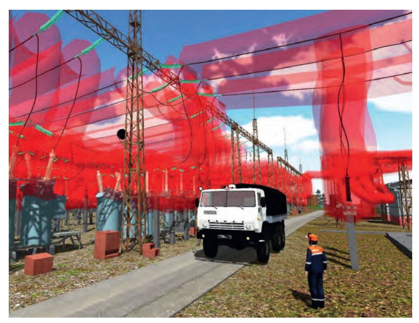
▲ Figure 3, Danger zones for workers modelled as semi-transparent red tubes.

3D models of vehicles and workers were created for animation purposes, allowing users to move them around the site just as in a game (Figure 2). The 3D model of the site was complemented by the incorporation of electrical danger zones according to current standards and regulations. The size of the danger zone depends not only on the type of the conductor voltage, whereby a higher voltage means a larger zone, but also on the type of objects moving through the scene - danger zones for workers are smaller than for vehicles and machines. The various types of danger zones were modelled and visualised in the scene as semi-transparent tubes around the conductors (Figure 3). Blue indicates danger zones for machines and red for workers.