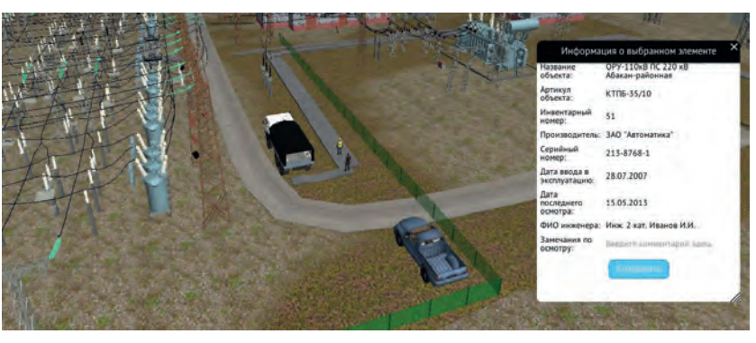
▲ Figure 2, 3D models of vehicles and workers; information on scene elements can be displayed.